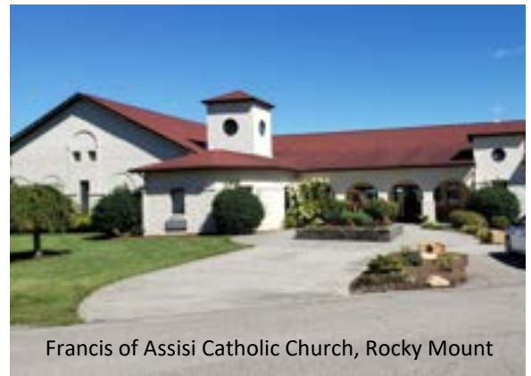
Francis of Assisi Catholic Church, Rocky Mount