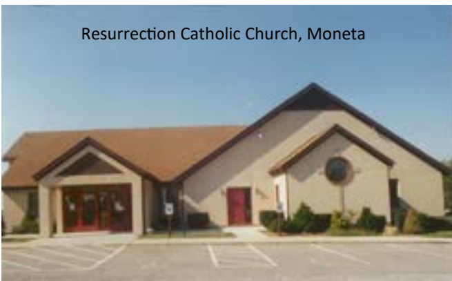
Resurrection Catholic Church, Moneta

Churches on this page each gave over $2,000 last year. The Free Clinic is supported by over two dozen local churches.